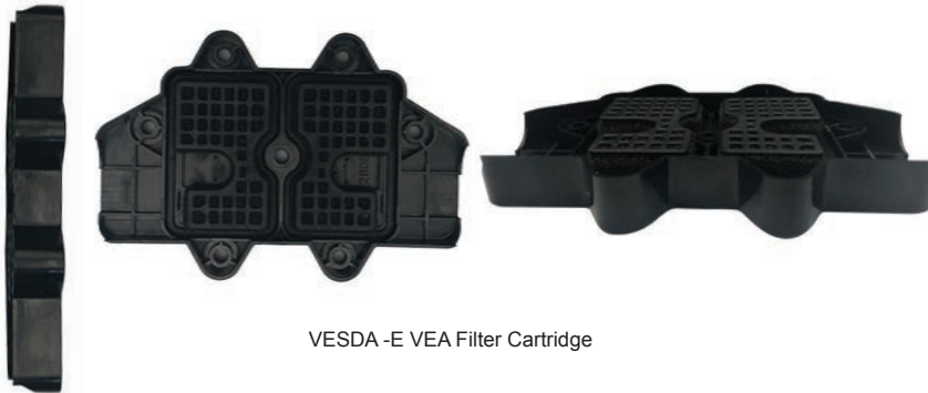
VESDA -E VEA Filter Cartridge

VESDA-E detectors have field replaceable parts, one of which is the filter, VEP/VEU/VES filter part no. VSP-962, VEA filter part no. VSP-972.